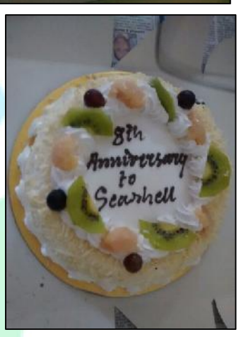
Warm Regards / Meena Harne